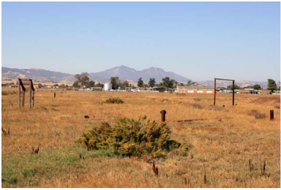
Abandoned Challenge Course at the rear of the property