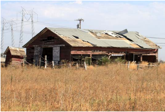
Barn in Disrepair