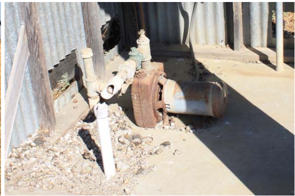
Abandoned electrical panel and water well near the barn