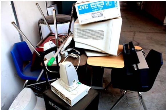
Computers and other junk