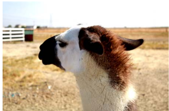
One of three Llamas at the Youth Center