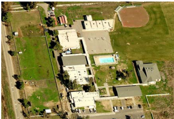
A horse coral is located on the upper left, goats on the lower left, and a few goats and Llamas in the pasture on the lower right.

17. The animals at the Youth Center include a horse, a few goats, chickens, and llamas. None of the animals appeared to have shelter from the sun, rain or cold.