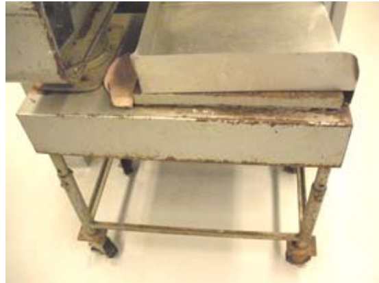
Scales in kitchen with dirty sock