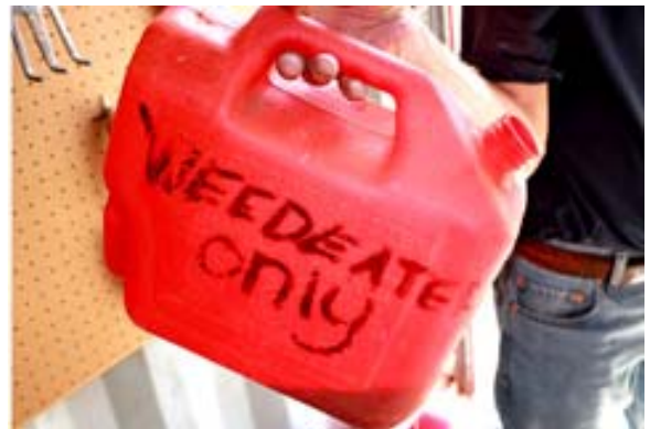
Open gasoline container

15. A dilapidated barn with parts of the roof and sides missing is located in the center of the property. A large abandoned plastic tank is stored near the horse corral along with debris.