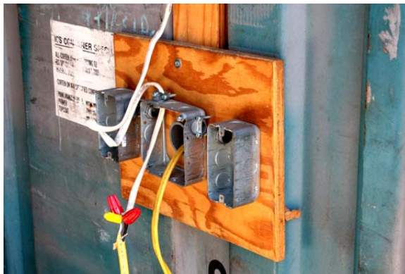
Electrical connections in a storage container

14. Commercial metal shipping containers, now being used for storage, contain dangerous electrical wiring and open gasoline containers.