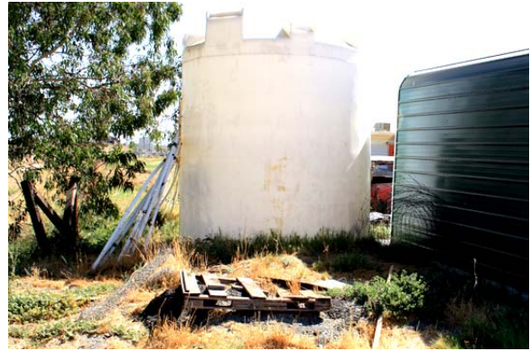
Unused tank and junk

16. Abandoned electrical switch panels and water pumps, some of which may be hazardous, are present throughout the property.