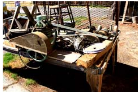
Inoperative vehicles, hazardous equipment and clutter