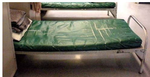
Lumpy and cracked mattress