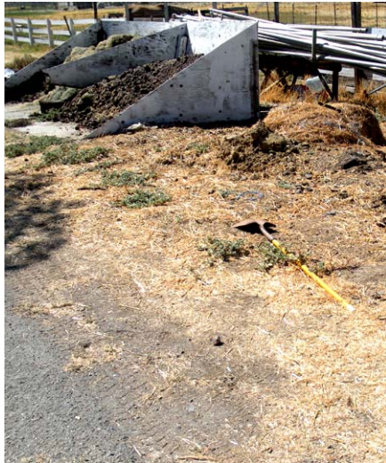
Manure and compost