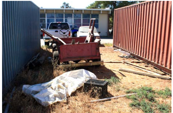
Debris between two storage containers

14. Commercial metal shipping containers, now being used for storage, contain dangerous electrical wiring and open gasoline containers.