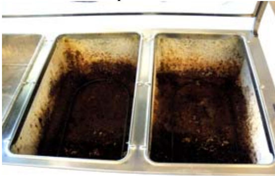
Steam table in kitchen