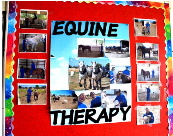
A bulletin board at the Youth Center touts an Animal Husbandry Program that no longer exists.