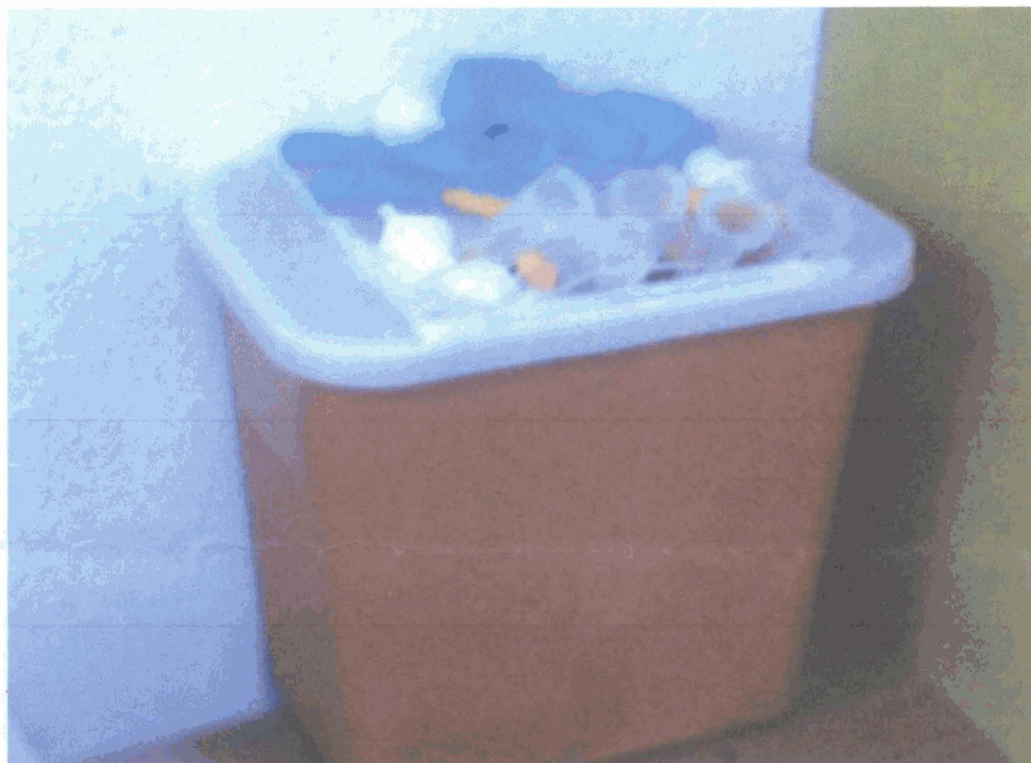
"Old container" in violation