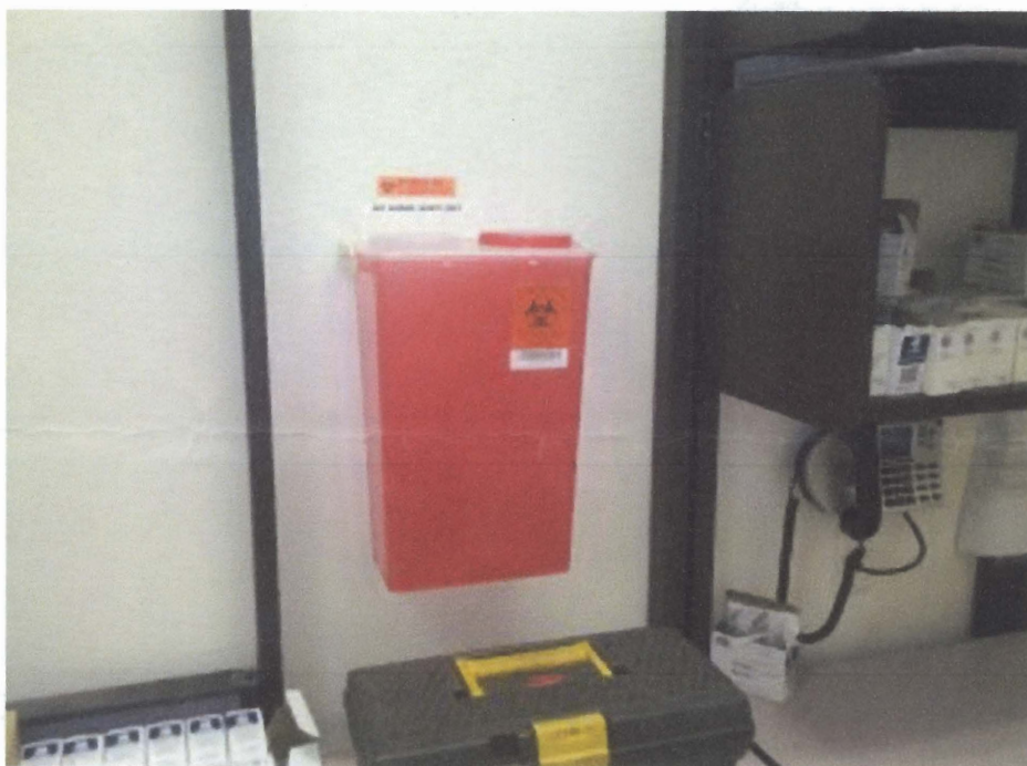
Property booking area