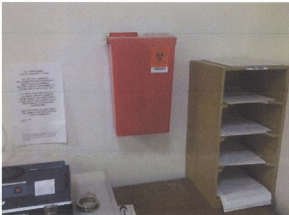
Jail Booking – Intoxilizer Desk