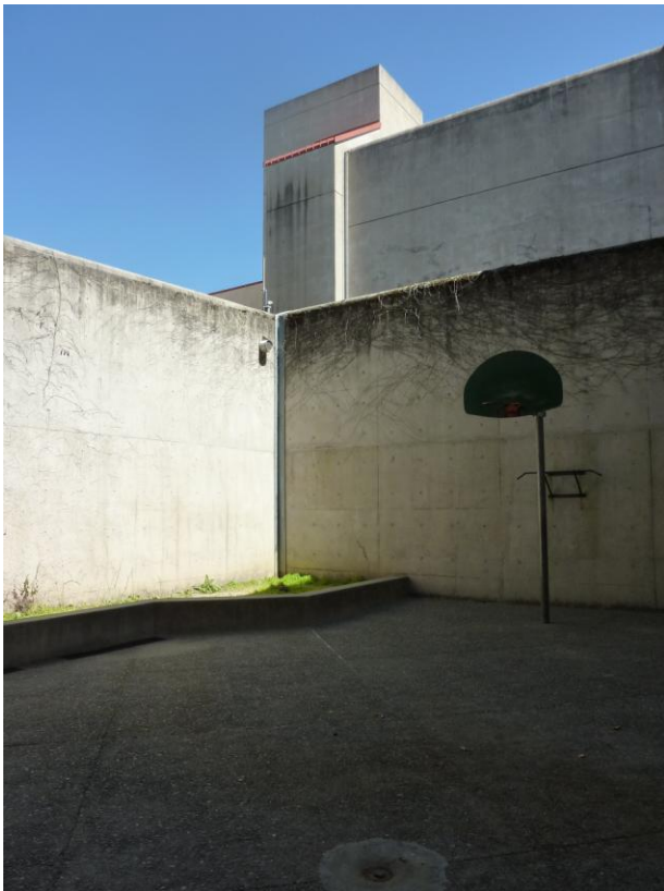
The Outside Courtyard of the Q Wing at the Martinez Detention Facility