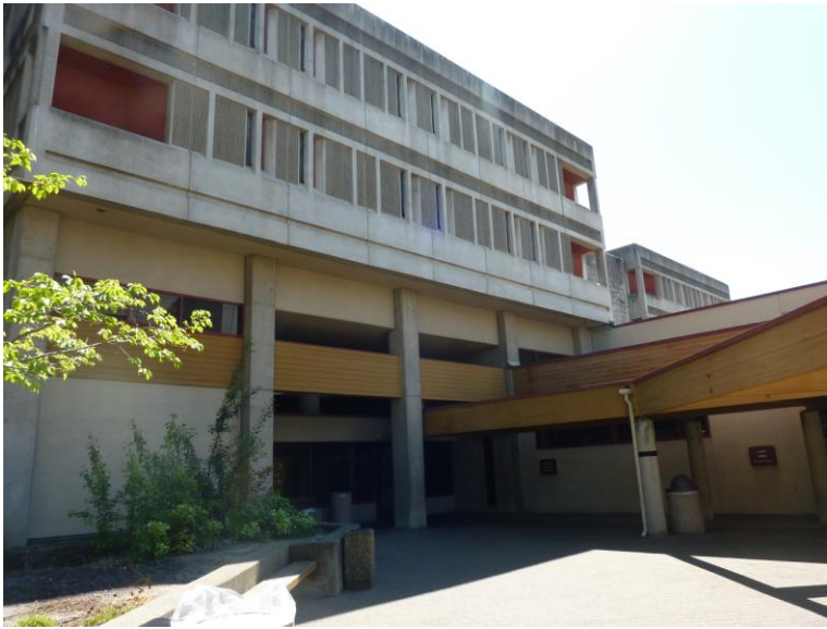
The Martinez Detention Facility in Downtown Martinez