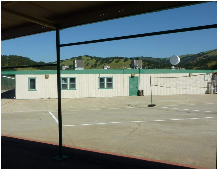
The MCDF "D" Wing and Outside Courtyard