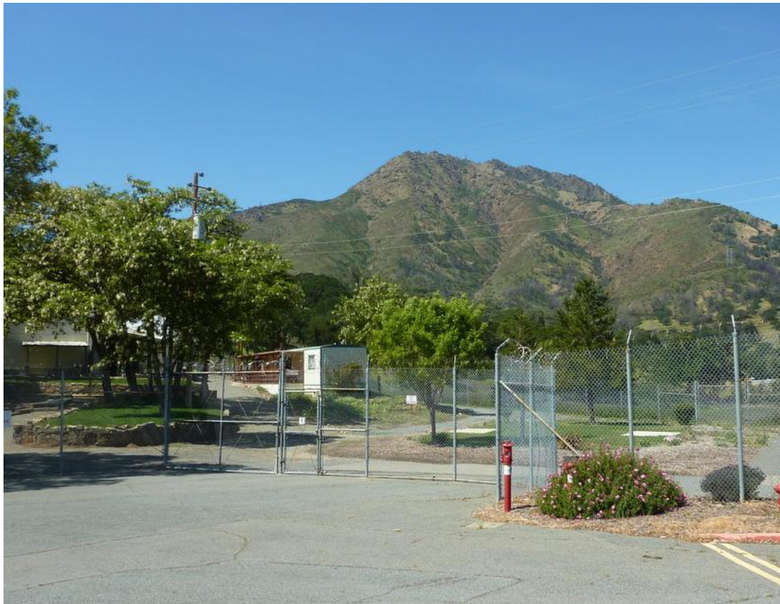
The Marsh Creek Detention Facility

MCDF, built in 1942 at the foot of Mt. Diablo in Clayton, has capacity for 160 inmates. Its population fluctuates between 30 and 80 inmates, averaging approximately 50 inmates daily. There has not been an escape in years even though inmates could throw a blanket or mattress on the razor wire and climb over the fence. The staff reports that there are minimal behavioral conflicts among inmates. One deputy is assigned for the night shift and the property lacks security cameras. The inmates spend their days tending to the landscape and cultivating grape vineyards for commercial production. They prepare food, take classes to obtain high school diplomas, learn job re-entry skills, and master woodworking. There are substance abuse rehabilitation classes as well as stress management classes. In addition to a lending library and basketball courts, there is a chapel that provides weekly spiritual services for all denominations.