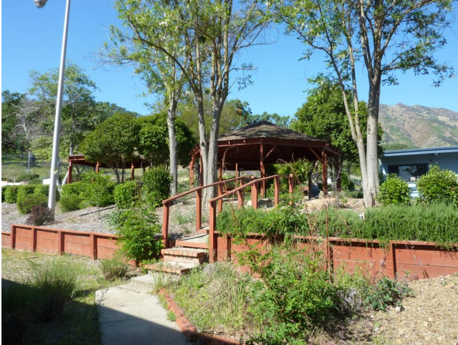
The Grounds of the MCDF