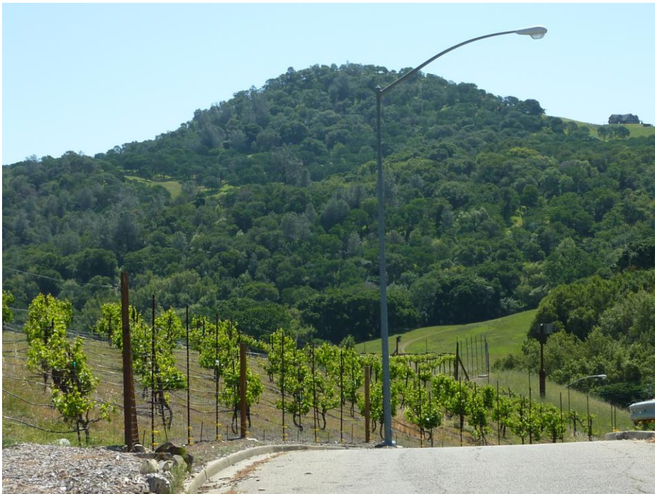
The MCDF Vineyards