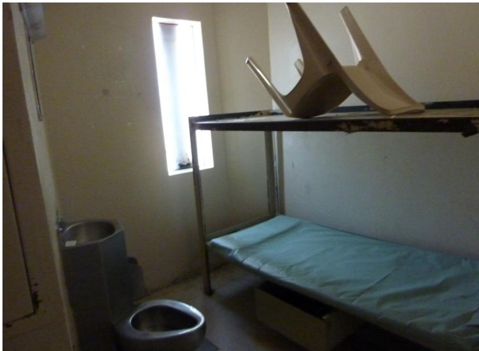
A double cell at the Martinez Detention Facility

The Martinez Detention Facility was never intended to house inmates for a long period of time, but due to state-mandated prison realignment in 2011, inmates can be in custody for years while awaiting trial. Inmates are doubled-up in the interior cells and are allowed to leave their cells for only one to three hours per day. Maximum security inmates are allowed to leave their cells for one hour and ten minutes every other day . Outside areas are rectangular cement slabs surrounded by high walls. Inmates eat meals in their cells. There is no dedicated space for classes.