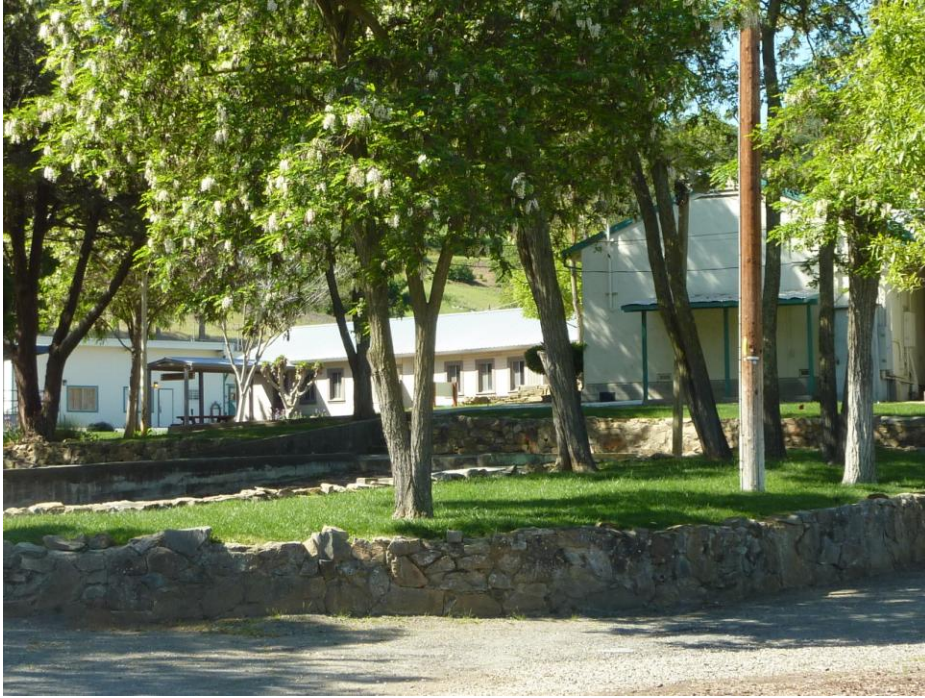
Classroom Buildings at the MCDF