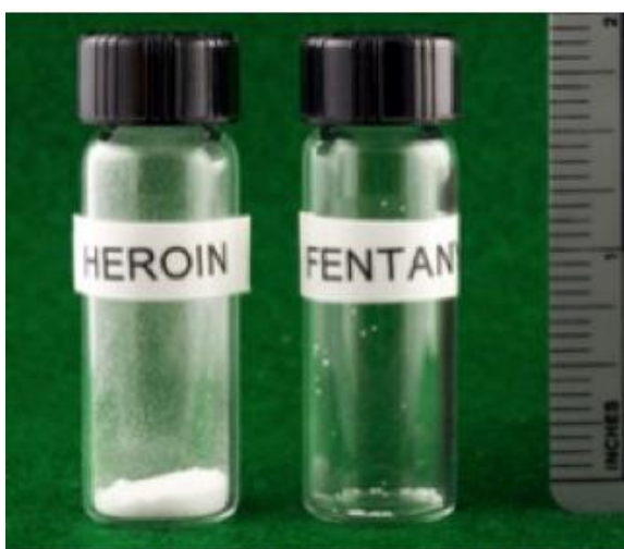
Lethal doses of heroin and fentanyl

Heroin users often do not know what has been mixed with the powder. This unknown mixture increases the risk of unknowingly receiving more powerful opioids or other toxic chemicals. Because fentanyl is so cheap and readily available, it is often mixed with heroin, creating a deadlier dosage.